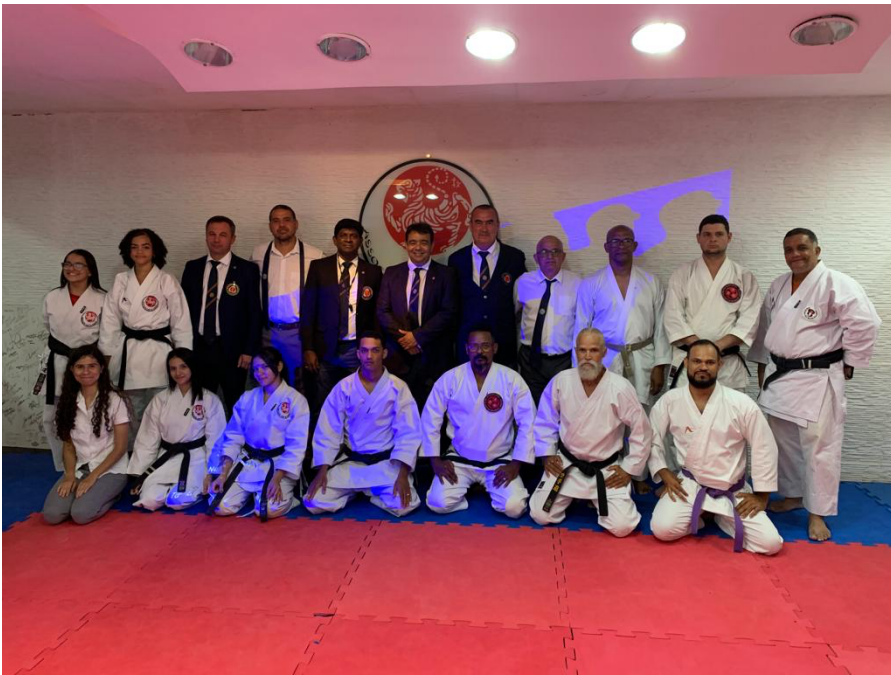
Completion of the black belt exams. Athletes together with members of the examination committee. From right to left: Vyacheslav Timofeev, President of the World Karate Confederation, 9th dan. (Russia); Osvaldo Cane, 8 dan (Brazil), Faustin Moses Rethinam, 8 dan (India).