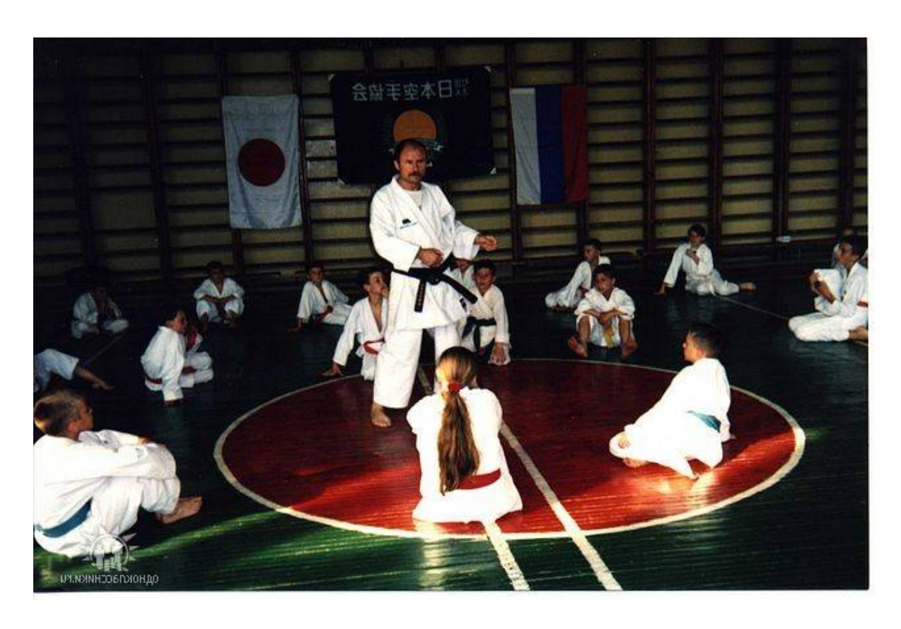
City of Vladivostok, Primorsky Territory, 1991, Conducting a technical seminar.