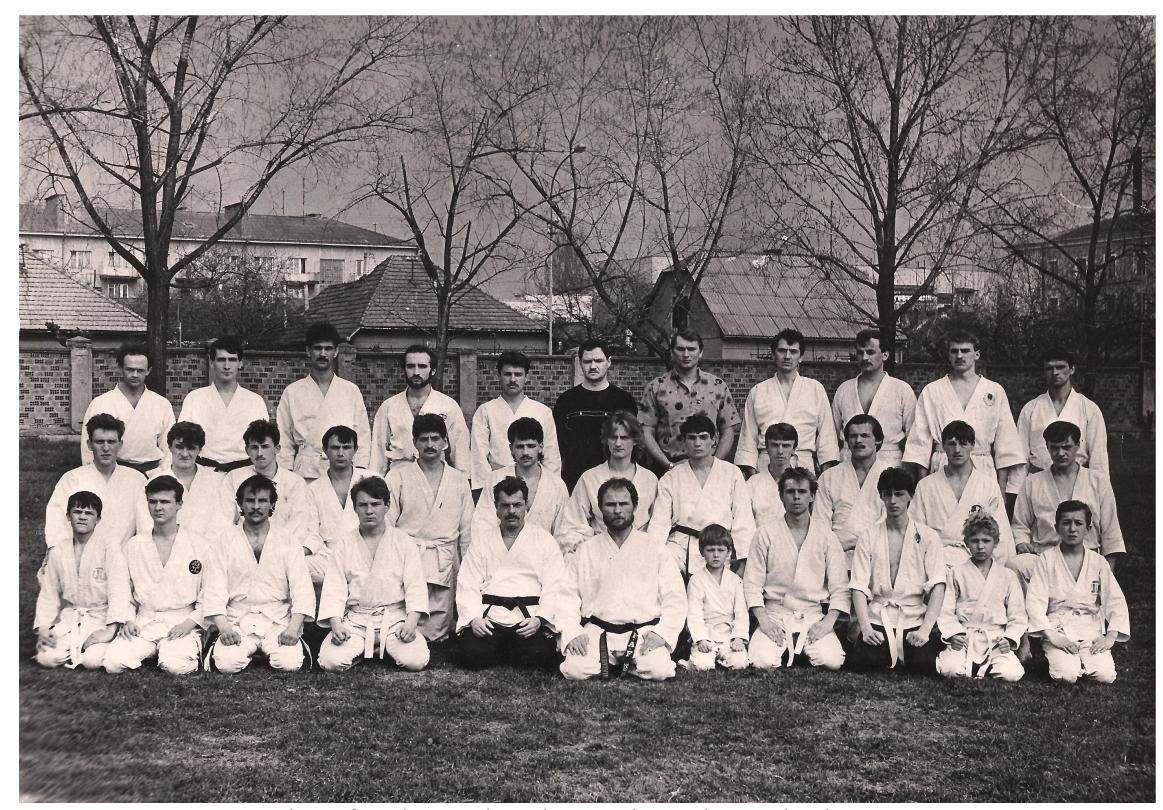
City of Uzhgorod, Zakarpattia region, Ukraine, 1993.