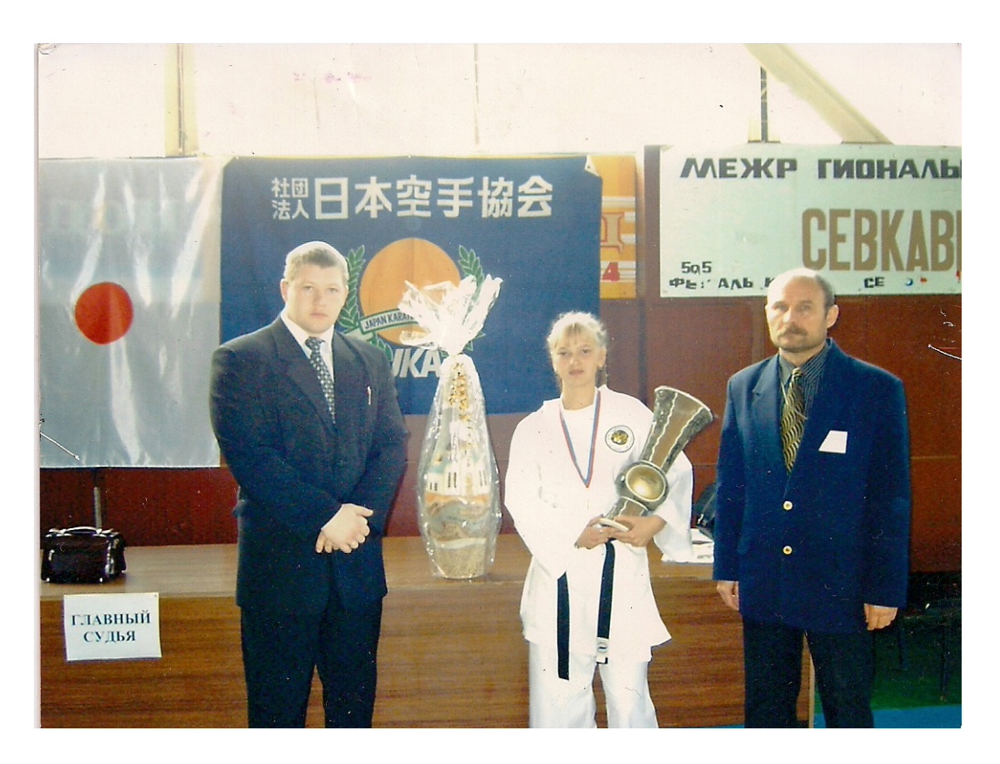
City of Pyatigorsk, Regional tournament.