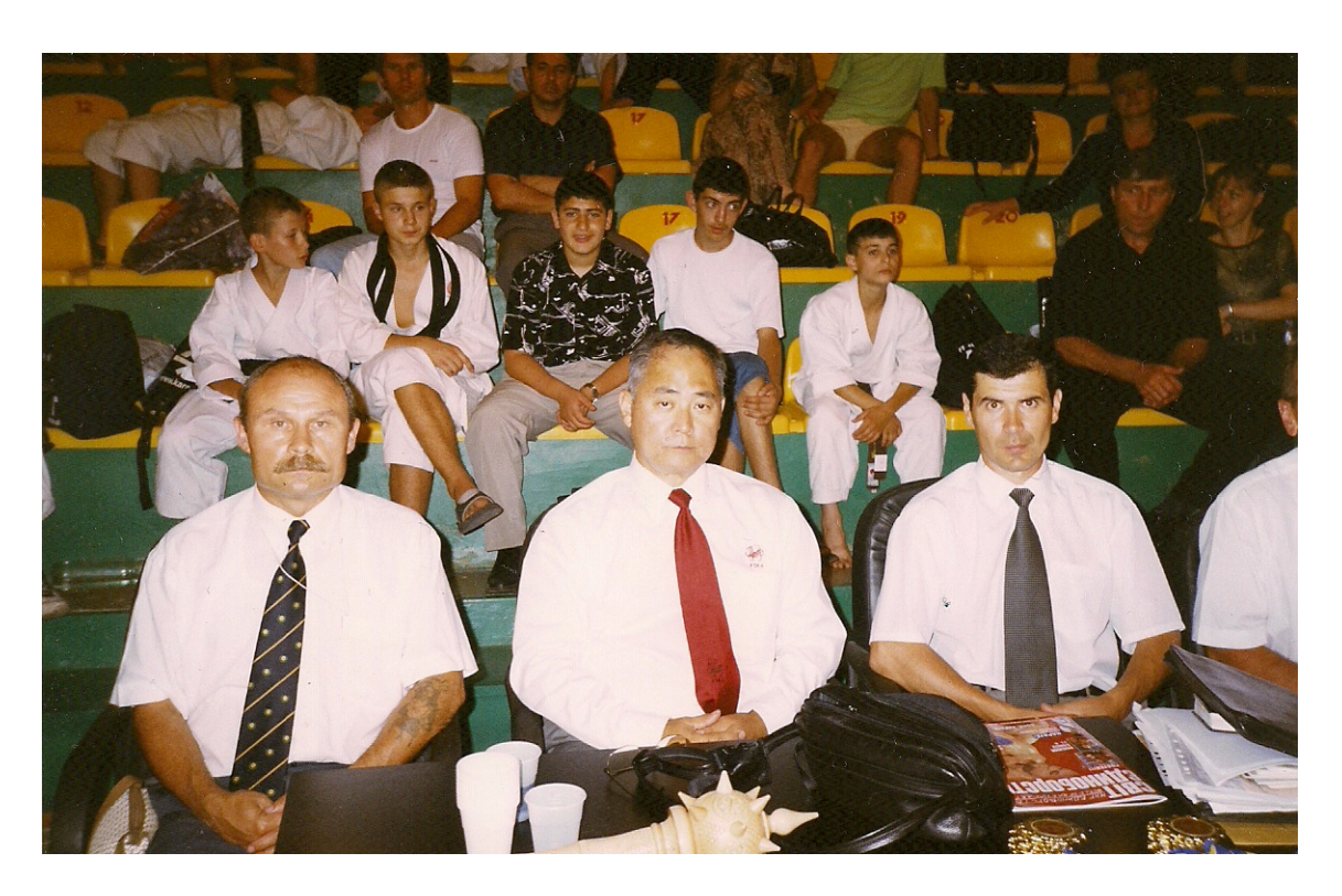
Ukraine, city of Chernivtsi, technical seminar of Funakoshi.