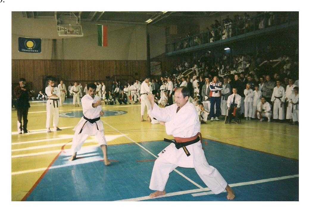
Eurasia Championship. Tatarstan, city of Kazan. Individual kata competition.