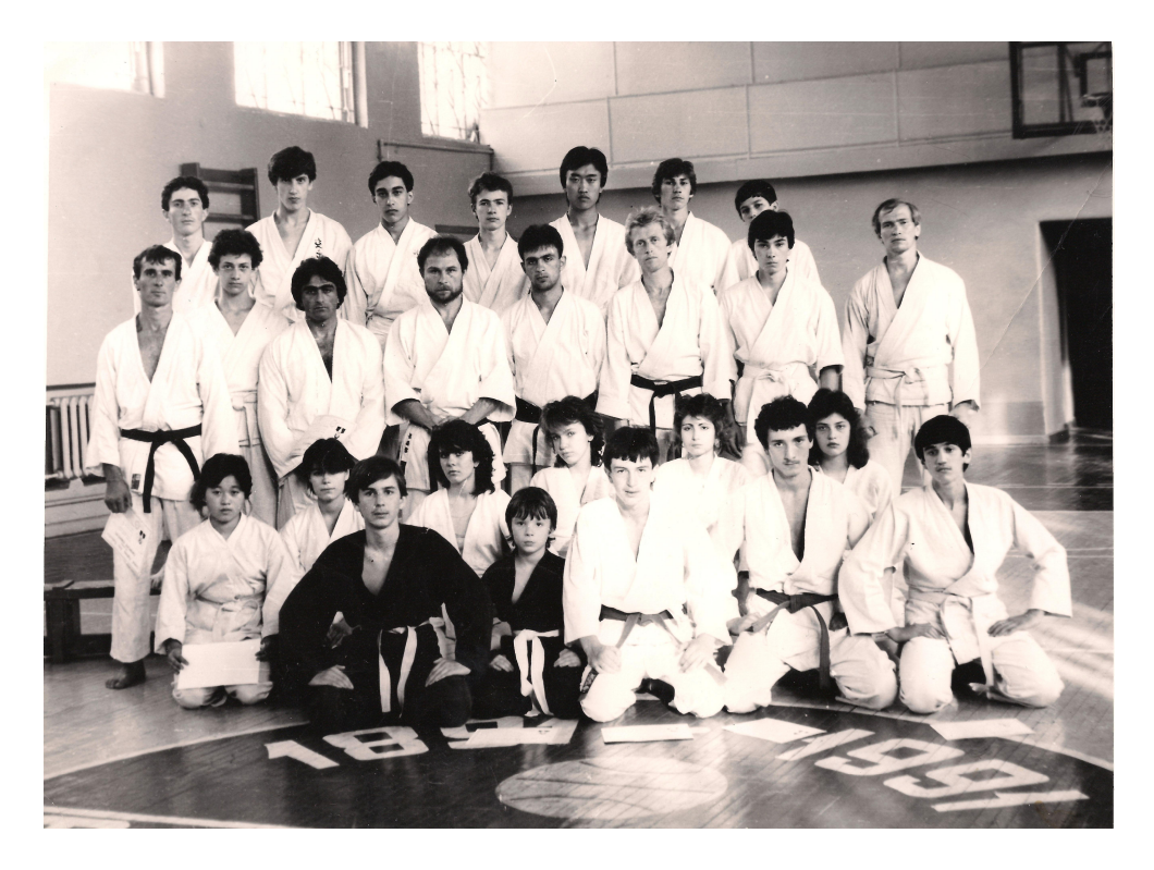
The city of Nalchik, Kabardino-Balkaria, 1988.