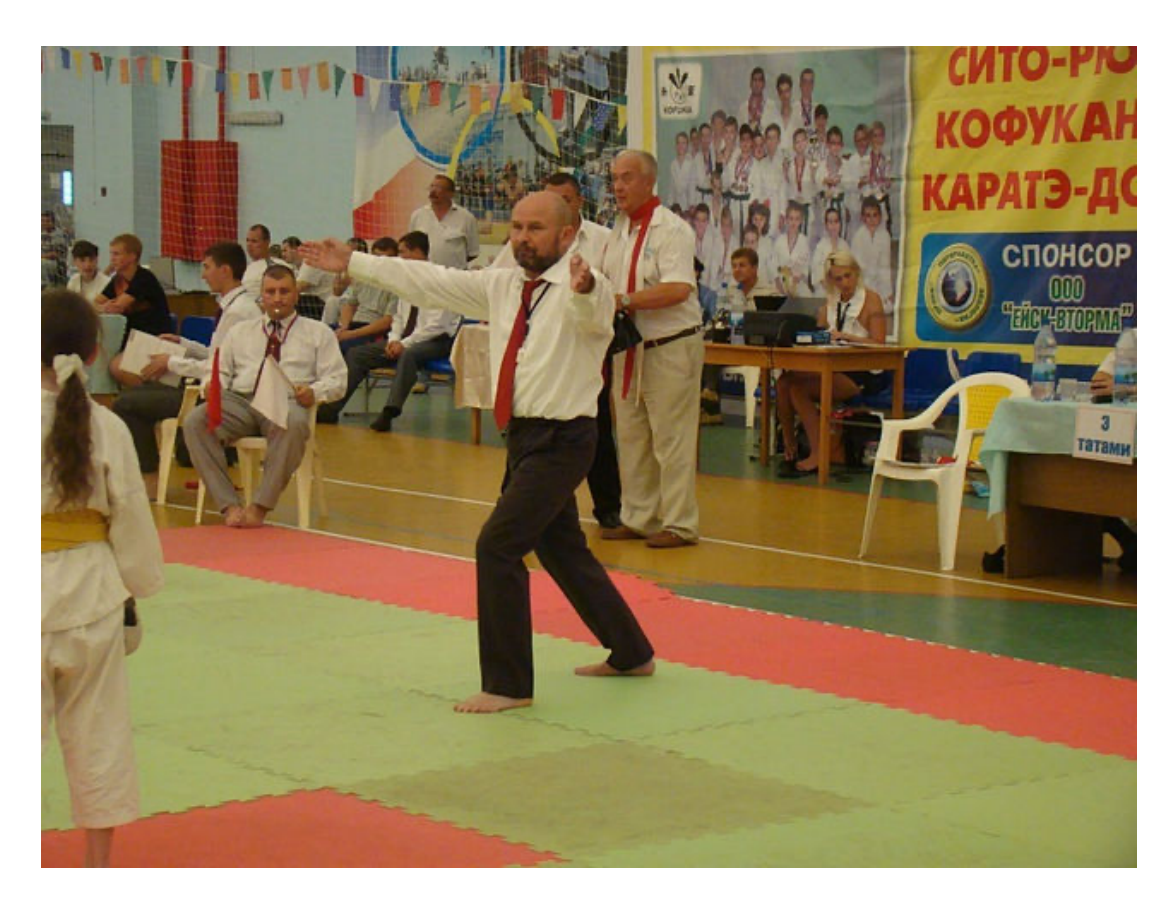
City of Yeysk, Cup of the Sea of Azov.