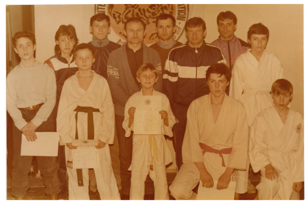
City of Rostov-on-Don, 1992.