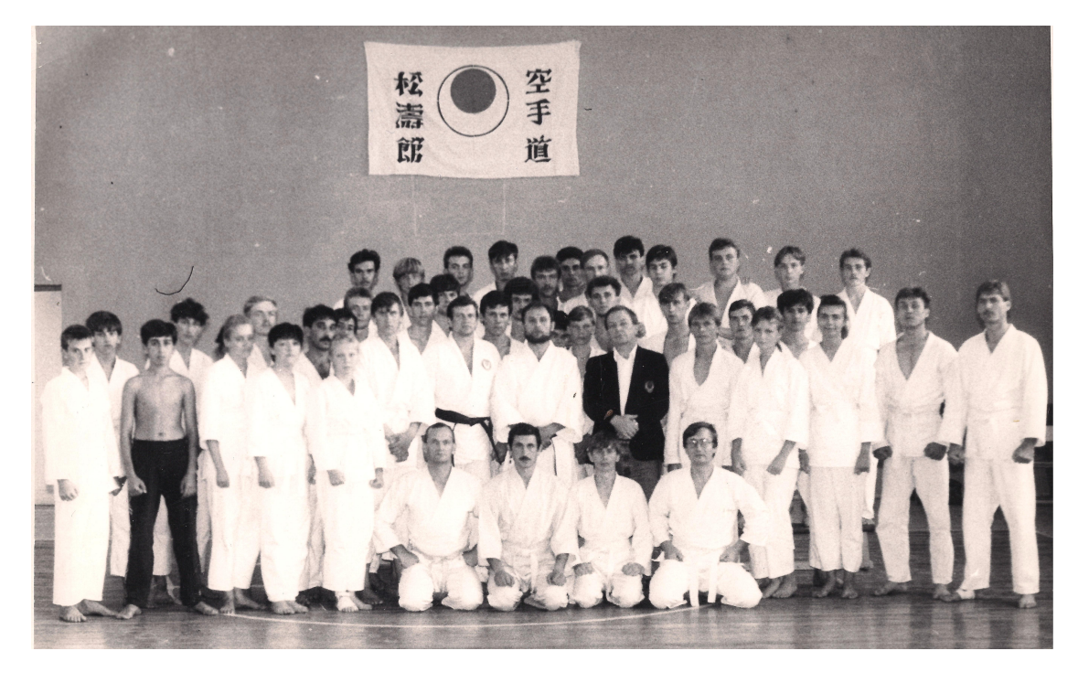
The city of Budennovsk, Stavropol Territory, 1988.