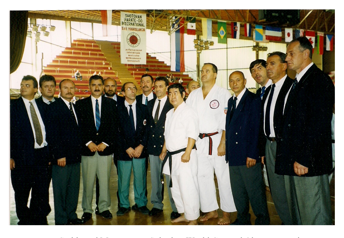
Serbia and Montenegro, Subotica, World Cup and Okuyama seminar.