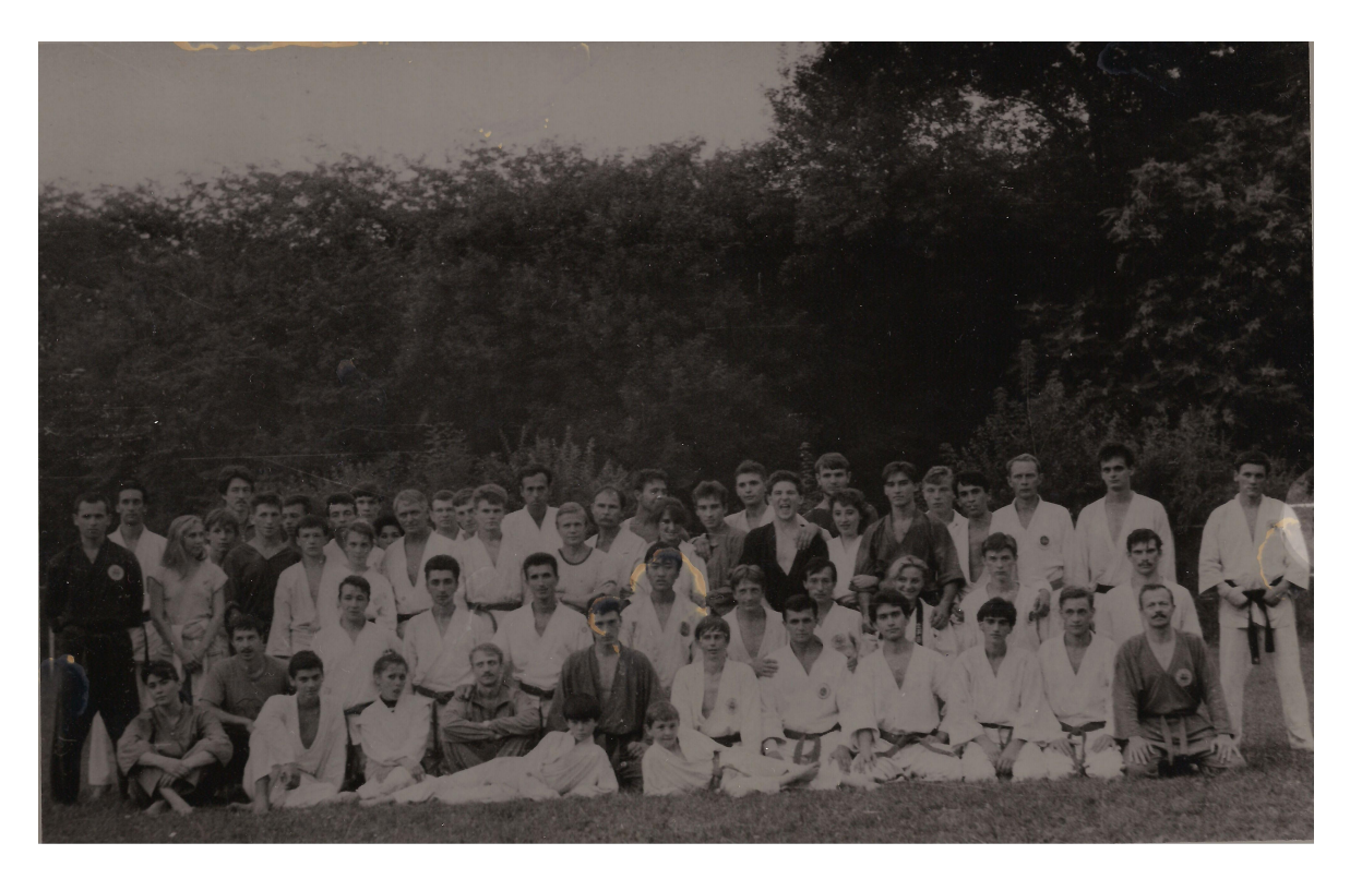
City of Omsk, 1990, Conducting a technical seminar.