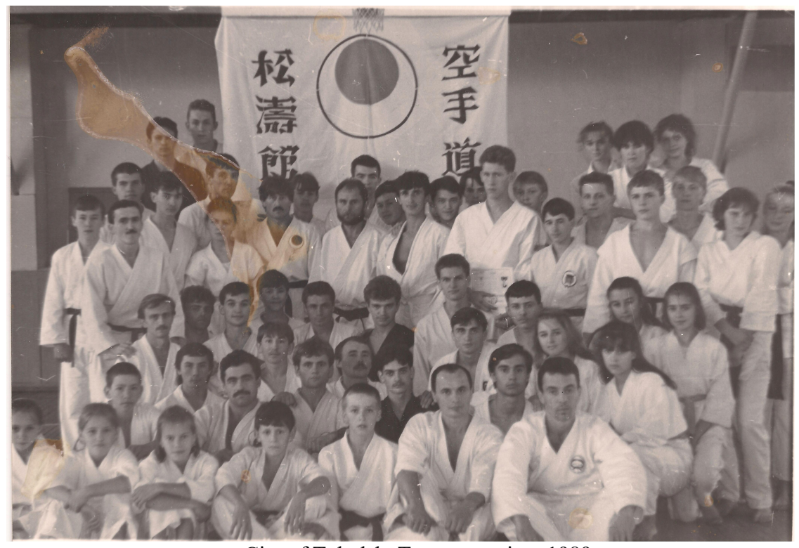
City of Tobolsk, Tyumen region, 1989