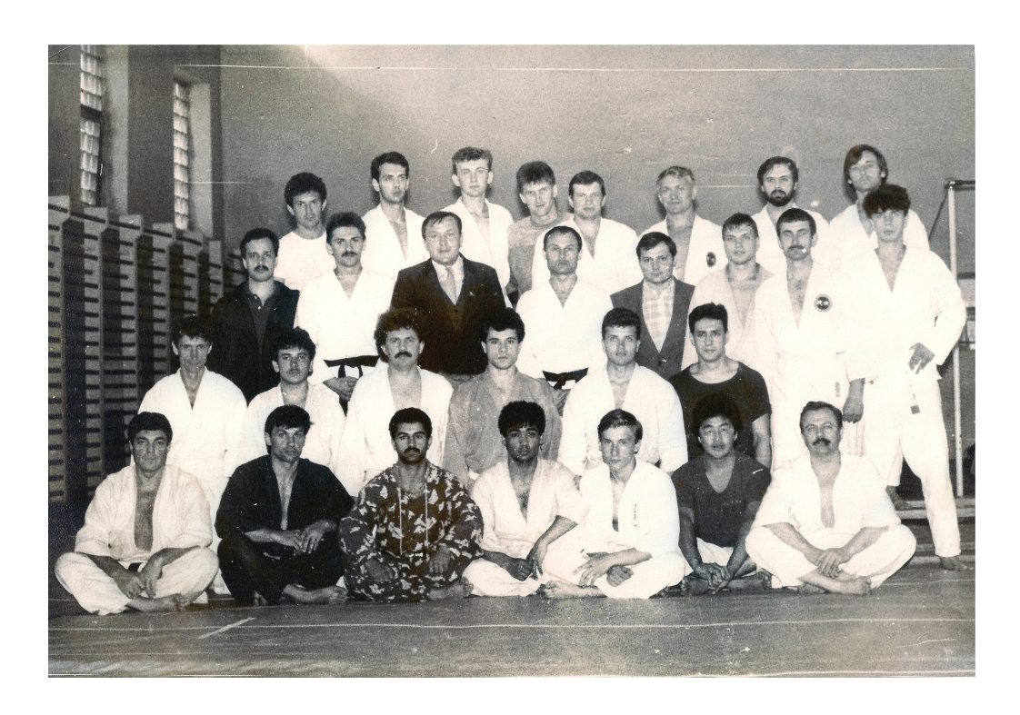
The city of Novocherkassk, 1983. I conduct a seminar for army special forces and riot police.